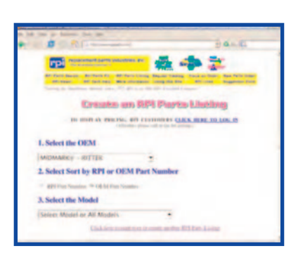
To create a Parts Listing on the RPI website, the user selects a type of equipment, then the name of the OEM, and then the model. At that point, a listing of all parts that fit the model is displayed. It's simple and fast!