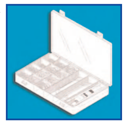
Customers are demanding more RPI value added kits, because they offer just about everything needed for servicing specific aspects of equipment in one convenient kit such as this O-ring Kit for servicing endoscope washers.

first exclusive, value added kit from RPI. Following that kit, came the Calibration Kit for servicing ultraclaves, and later the specialty O-ring Kit for servicing endoscope washers. These are kits that RPI customers appreciate, and are demanding more of in the future because they offer just about everything needed for servicing specific aspects of equipment in one convenient kit.