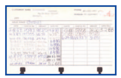
Original RPI customer card soon replaced by the computer.

to work with Jim Valle, who keeps our computer system up