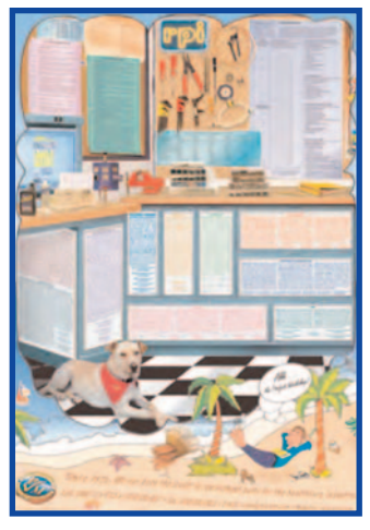
RPI introduced Planned Maintenance (PM) Month to the healthcare service industry, and since then it is celebrated by our customers every June with a free PM poster from RPI.

Academy Award Best Picture: Braveheart; In Superbowl XXX, The Dallas Cowboys become the first team to win 3 Superbowls in a span of 4 seasons; Dolly, a Finnish Dorset ewe, was the first mammal to have been successfully cloned from an adult somatic cell (1996)