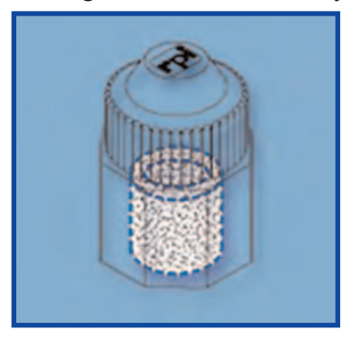
RPI also focuses on developing oneof-a-kind parts such as our clear filter housing that allows visual inspection of the filter inside, without having to remove the housing.

With respect to the design and development of parts, RPI has expanded its goal of manufacturing parts that meet or exceed the OEM's performance. Today, RPI also focuses on developing one-of-kind parts such as a clear filter housing vs. the OEM's brass-nickel plated housing that fits dental delivery systems that was just launched earlier this year.