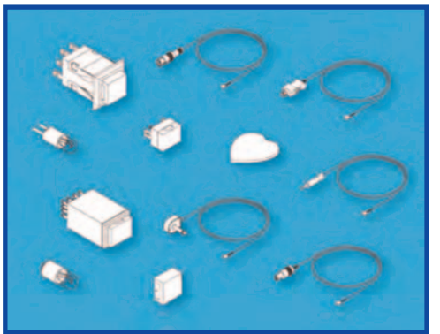
Our customers demanded more parts to fit infant warmers and incubators — not only did we respond with replacement parts, but also skin temperature probes. Now neonatal departments can depend on us for parts as well as reusable and disposable probes.

Also in 2005, we again went into action in response to our customers. This time our customers demanded more parts to fit infant warmers and incubators. In fact not only did we respond with replacement parts, but also skin temperature probes. Now neonatal departments can depend on us for the parts they need most to keep the machines up and running as well as reusable and disposable probes.