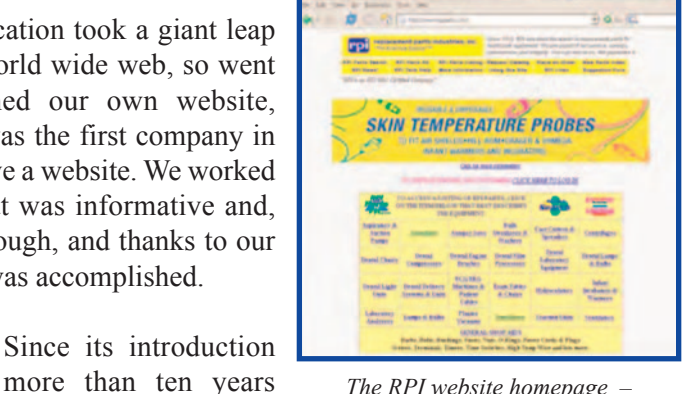
The RPI website homepage – from here, the user has access to service tips, tech help, at–a–glance parts, cross reference guides, and so much more!

technical assistance, ata-glance parts cross reference guides, troubleshooting guides, and exploded views of equipment. Perhaps the most impressive tool on the website is the one that assists its users in finding parts. The search tool is based on a hierarchy system in which the user selects a type of equipment, then the name of the original equipment manufacturer (OEM), and then the model. At that point a complete listing of all parts that fit the model is displayed with an option to obtain details and an illustration for any of the parts listed. It's simple and fast.