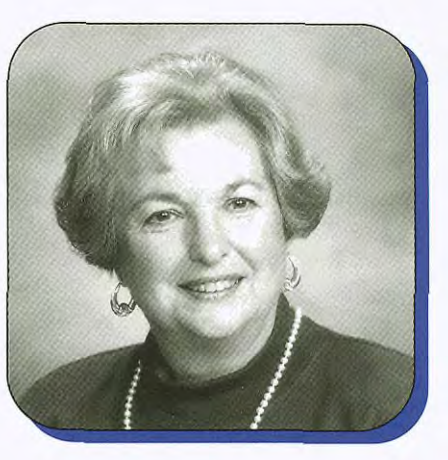
From The President & The President's Boss

After forty years of being together, it seems as if we have always been married and after twenty-five years, its seems as if there has always been an RPI in our lives. These twentyfive years have had their ups and downs (mostly up, thank goodness), but we wouldn't have traded them for anything.