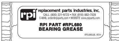
BEARING GREASE (RPI Part #RPL680)