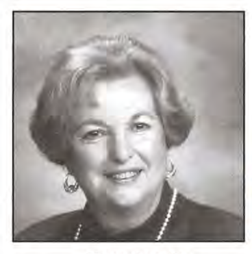
8 to 4 no more