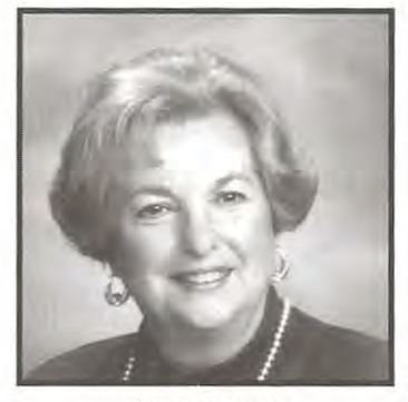
8 to 4 No More