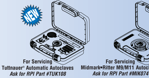
Table Top Sterilizer Diagnostic and Calibration Kits include the tools and parts that make your job easier ... Now there are three Smart Kits®. Visit the RPI website for details.

To help you locate the exact part you need for the specific unit you are servicing, RPI identifies the model, style and serial number prefix for each of the parts we offer to fit these Midmark units. Simply refer to our catalog or website, www.rpiparts.com. Or give us a call in Tech Support, at (800) 221-9723, ext. 135.