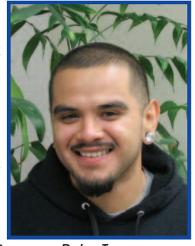
Peter Tores Shipping & Warehouse

Both my parents worked while I was growing up so I depended on myself to cook my